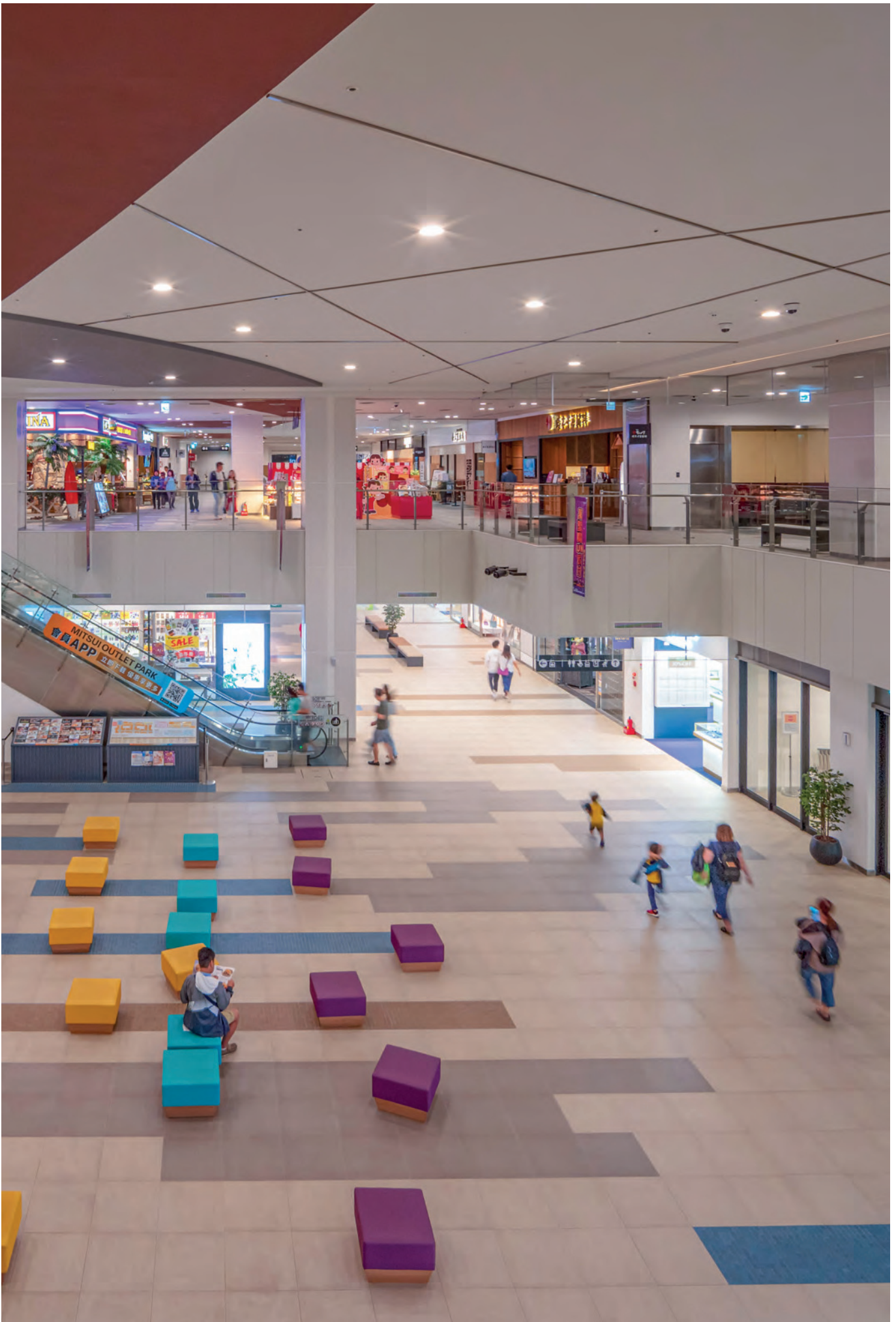
MITSUI outlet park - Taichung - Taiwan