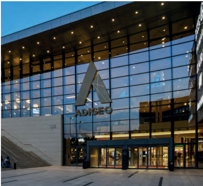
Adigeo Shopping Centre - Verona - Italy